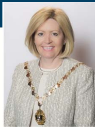
The Right Honourable the Lord Mayor Ms Lisa-M. Scaffidi